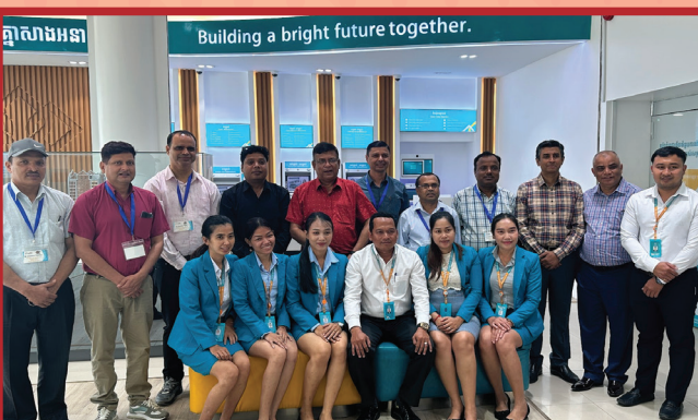
6-8 February 2023, Phnom Penh, Cambodia