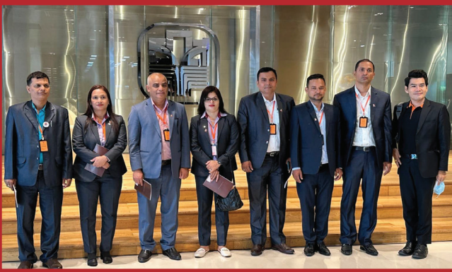
23-25 May 2023, Bangkok, Thailand