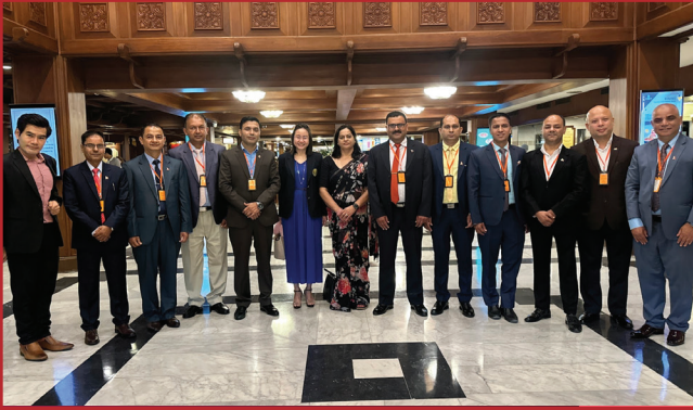
25-28 September 2023, Bangkok, Thailand.