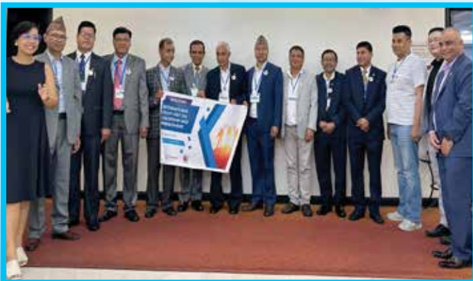
8-10 March 2023, Manila, Philippines