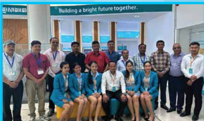
6-8 February 2023, Phnom Penh, Cambodia