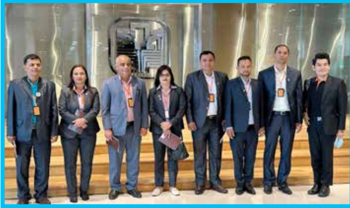
23-25 May 2023, Bangkok, Thailand