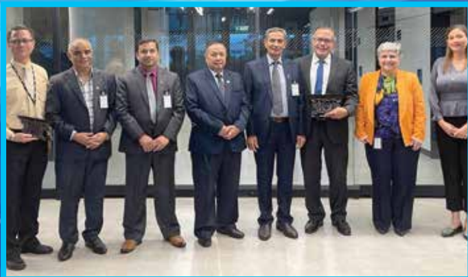
November 2022, San Jose, Costa Rica