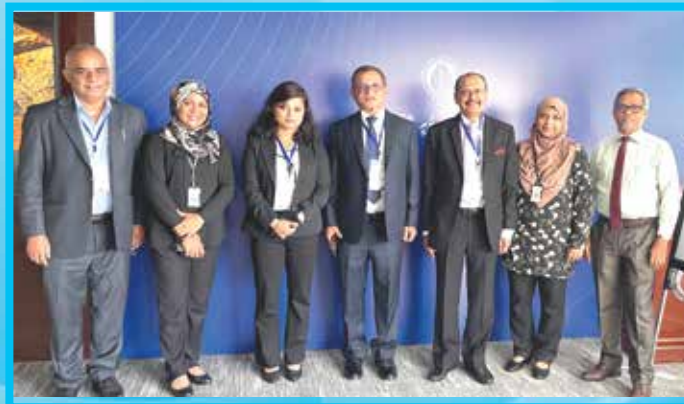
May 2022, Male, Maldives