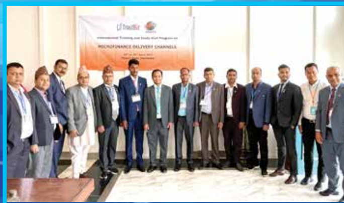
April 2022, Phnom Penh, Cambodia