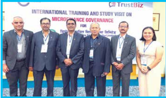
June 2022, Hanoi, Vietnam