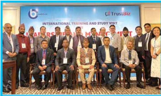
June 2022, Hanoi, Vietnam