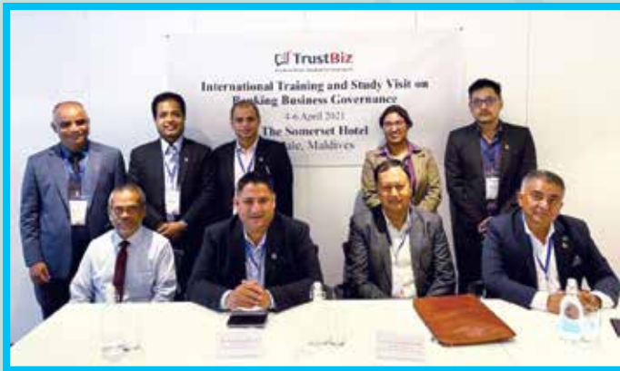
April 2021, Male, Maldives