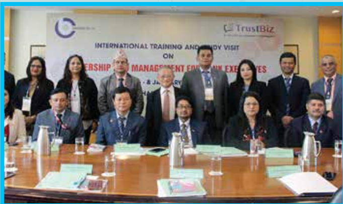
January 2020, Hanoi, Vietnam