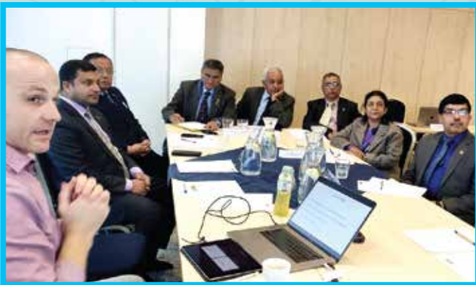
February 2020, Prague, Czech Republic